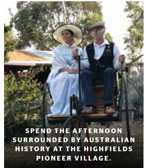
SPEND THE AFTERNOON SURROUNDED BY AUSTRALIAN HISTORY AT THE HIGHFIELDS PIONEER VILLAGE.

Start your day with sunrise views of the valley from Picnic Point on the escarpment. Enjoy a walk in Queens Park and the Botanic Gardens, followed by a hearty country pub lunch before returning to the coast via Gatton, taking a detour to explore the Queensland Transport Museum before continuing onto Esk